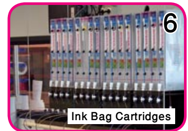
Ink Bag Cartridges